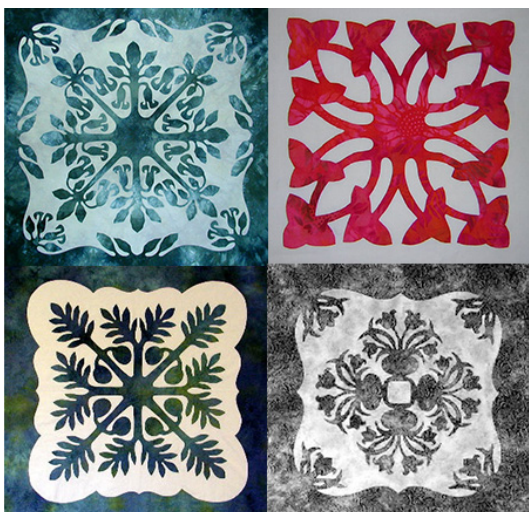
SAMPLE DESIGN OPTIONS