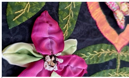
Dimensional wired-ribbon trillium petals and leaves with a shimmering drizzle-stitched center

We have stitched our Woodland Reverie blocks on both a dark and light background. Which will you choose?