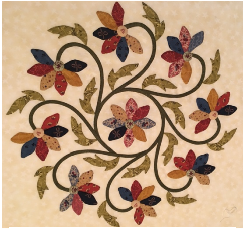
Choose Your Colorway