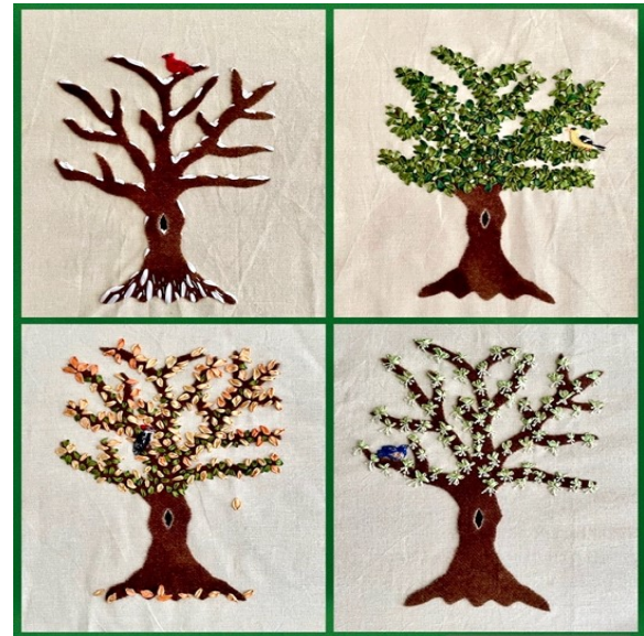
Village Wanderings Set 3—Trees Design area per tree 8"x10"