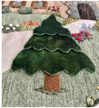
Dimension and detail are achieved with embroidery using a variety of threads and ribbon.