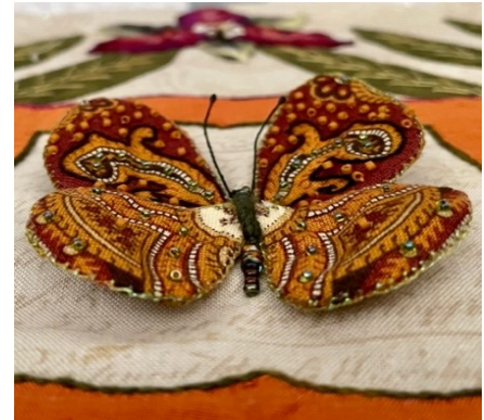
The butterfly is poised to fly, attached only in the center so the wings are free. Adding wire to the wings (optional) allows more molding to accentuate the dimensionality