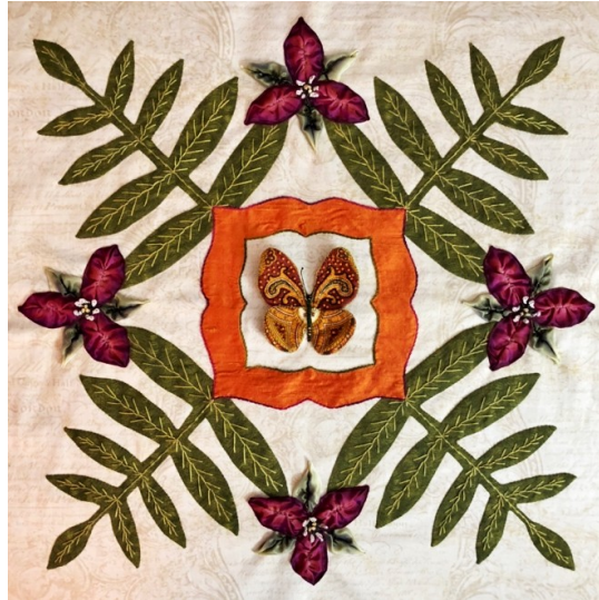
Butterfly and Trillium