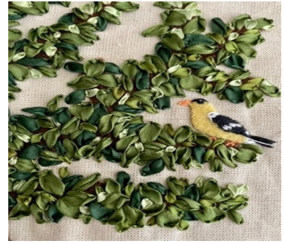
Each tree is host to a feathered friend; pictured here is the goldfinch in the summer tree.