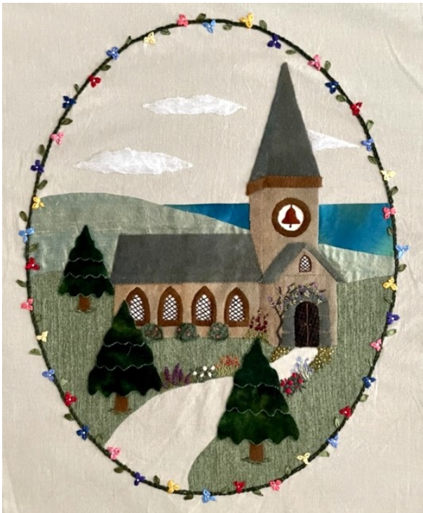
Village Wanderings center medallion Design area 17"x 21"