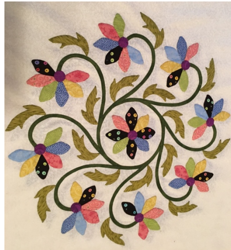
Choose Your Colorway